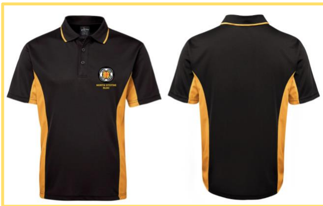
Polo Shirt $45

Swim jacket, super lightweight with a waterproof outer, and polar fleece inner. Perfect for carnivals, training or just down at the beach for some added warmth. A hooded towel will change your life! Made with velour toweling, it dries you off, keeps you warm, has pockets and makes changing on the beach easy! Both these items are available in sizes for Nippers up to Senior Members. The sizing chart is available on the order form.