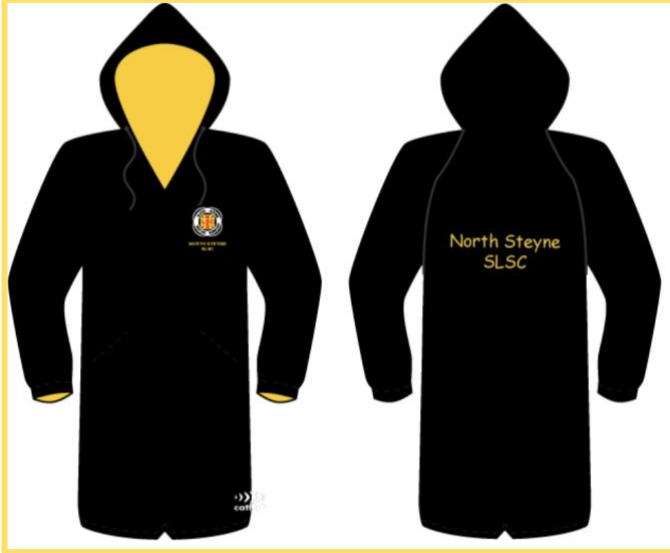
Swim Jackets $130