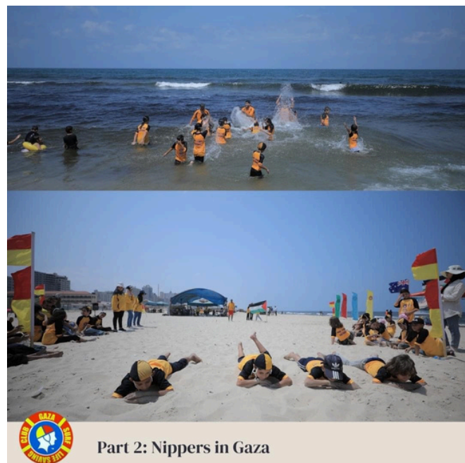
Part 2: Nippers in Gaza

On a more sombre note, after a very successful first season of Nippers on Gaza Beach, I am sad to report that the Nippers program has been suspended indefinitely. We remain hopeful, however, the one-day Nippers will return to Gaza Beach and North Steyne will be there to support when the time is right.